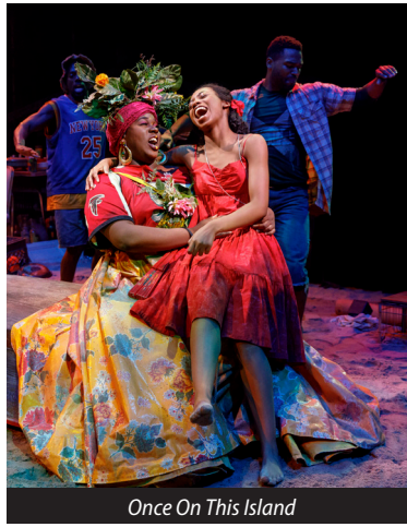
Once On This Island